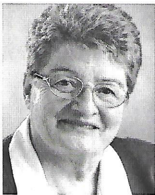
The IMF's Anne Krueger.

under the IMF's aegis. Whatever its merits, the need for universal acceptance made this a hopelessly impractical proposal. Her second initiative, in April, called for an amendment to the IMF's founding charter